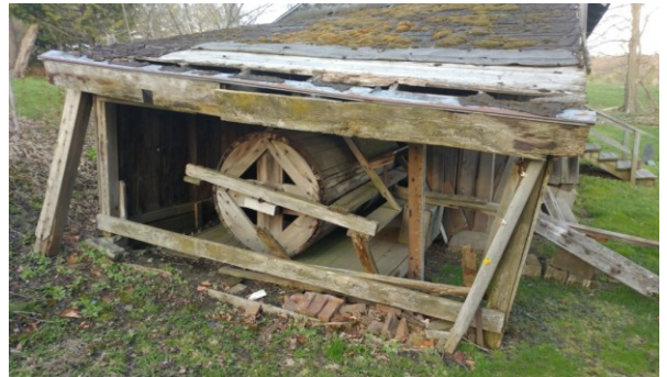
Snow roller in the shelter in very poor condition at the Marvin Newton House

The BHS is fortunate to have on display on Ridge Road the last known surviving snow roller that was used many years ago to pack down our town's snow covered roads before the advent of engine-driven snow plows. Unfortunately its shelter is in a state of severe disrepair and needs to be replaced. The BHS Board of Trustees has determined that this repair will take at least $3,000 dollars to complete the work. We are now soliciting funds for this effort and hope you and other community members can help get this project completed before another winter arrives. Please consider donating today!