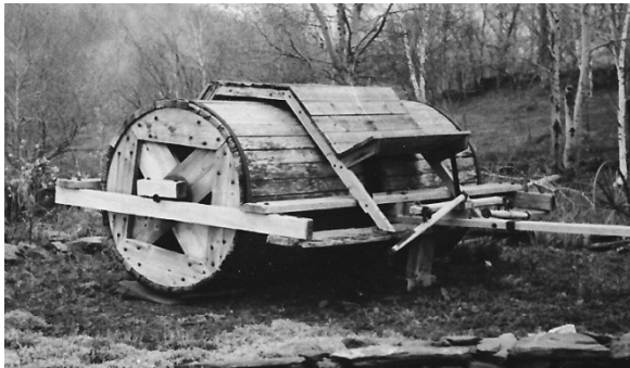
Snow roller used on the roads in West Brookfield in olden times